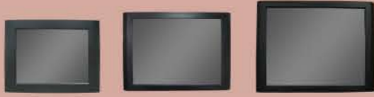
PT-120PF PT-150PF PT-170PF